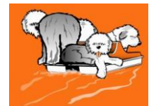
Event bandana design

Total T-shirts _____ x $13 each = $ _____