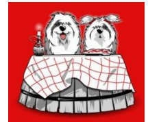
Event bandana design

Please include your name, address, etc., on the form below in case you cannot attend the event due to an emergency.